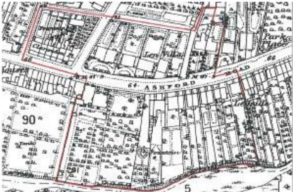
Fig 3 Extract from Ordnance Survey of 1867 showing current conservation area overlaid

4.5.1 Brooks Place is a short street running between Queen Anne Road and Albion Place, which originated as a rear access way to the Clarendon Place buildings in King Street. As such it never developed any primary frontage buildings, its north side being bounded by the flank walls and garden boundaries of properties in Queen Anne Road and Albion Place and its south side being defined by the rear boundaries of Clarendon Place together with mews type buildings such as stables or coach-houses serving those properties. By 1848, such buildings are shown to exist at the rear of nos. 2, 3, 5 and 6 Clarendon Place, and by 1867 these had been joined by a smaller building to the rear of no. 4.