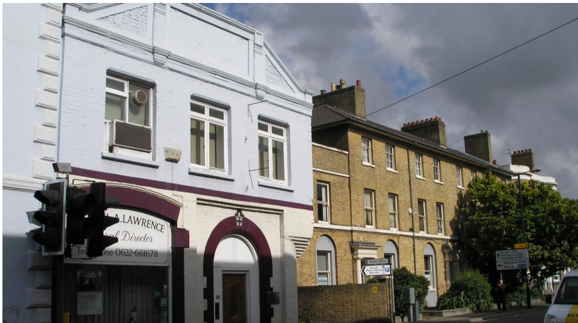
Entering the Conservation Area from the west the road widens significantly

4.2.2 The approach from King Street is marked by the sudden widening of the road and change in architecture brought about by the presence of Clarendon Place terminated by the two curving bays. The vista is closed by the curve of Ashford Road so what can be seen is the consistent elevations on the southern side referred to above. As one progresses to the east views leak away into the indeterminate area of traffic engineering and garage uses around the junction of Andrew Broughton Way and Ashford Road. In this area the bulk of Victoria Court (which replaced two early 19th Century villas) is, although outside the conservation area, a discordant feature.