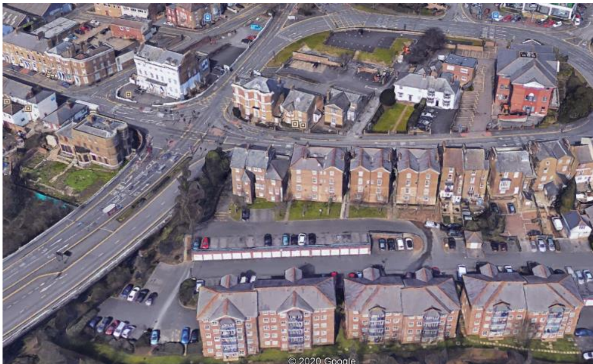
Aerial view of Conservation Area

1.1.3 In addition to these enhanced powers, the local authority is also required when dealing with applications for planning permission to have special regard to the question of whether or not the proposed development would either preserve or enhance the special character of the conservation area. ( Section 72.1 of the Act ) There is a presumption that developments which would not preserve or enhance this special character should be refused planning permission.