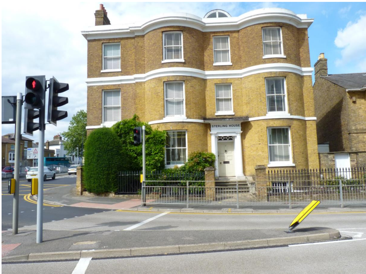
Sterling House No 7 Ashford Road

6.8 In addition, the modern development in River Bank Close may be considered for exclusion from the Conservation Area.