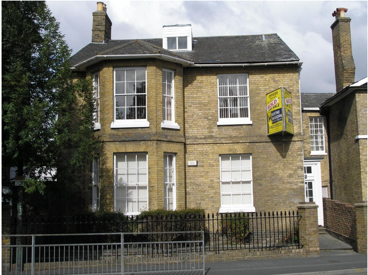
Typical property developed in Ashford Road for middle class residents

3.2.9 Change in character had become quite radical by the early post-war years, as shown by entries in Kelly's Directory of Maidstone 1947. Only two addresses are occupied by professionals and a number of buildings have been converted to flats (nos. 1, 8, 10 and 11) and nos. 4 and 5 Clarendon Place have become a boarding house. Two drapers are listed (at 1 Clarendon Place and 3 Ashford Road) and a turf accountant at 3 Clarendon Place. Nos. 7 and 15 Ashford Road have become offices and No. 4 the Maidstone Ex-Services Club. In one of the decreasing number of single dwelling houses left, no. 13 Ashford Road, a certain Leonard James Callaghan (the future Prime Minister) is listed as resident.