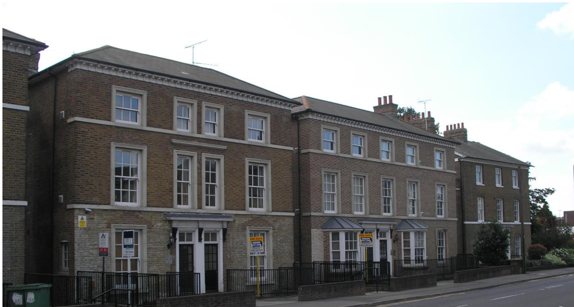
Ashford Road – a restrained Classical style

4.1.4 The dominant architectural style is a restrained classicism, and most buildings are characterised by such features as small-paned vertically-sliding sash windows of painted timber, panelled doors (often with fanlights above), door-cases or canopies and fine rubbed-brick arches or Italianate cornices over openings. The predominant building materials are yellow stock brick and natural slate roofs of low pitch, although there are some examples of stucco and red brick. Large, multiple-flued chimney stacks with chimney pots (some original), often positioned on flank walls, are noticeable features of the area.