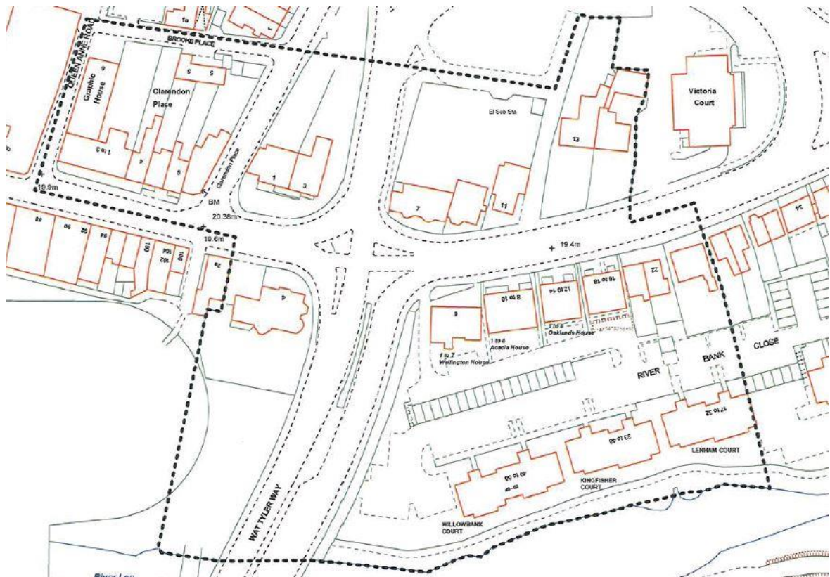
The Conservation Area as currently configured