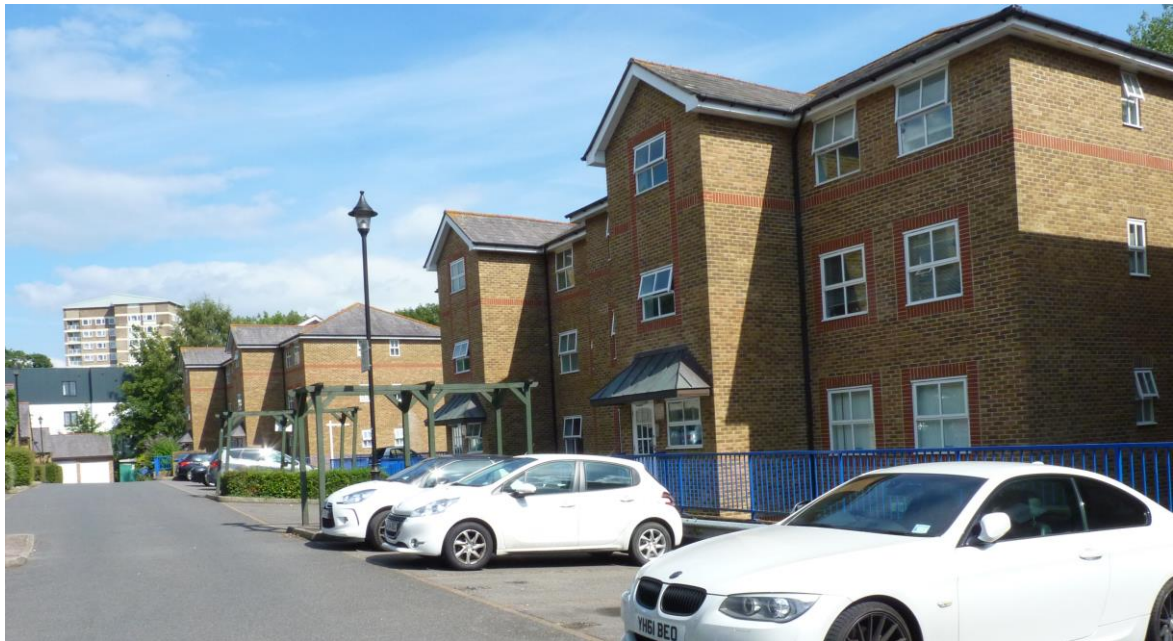
River Bank Close

4.7.1 River Bank Close, which is accessed off Square Hill Road, is a modern development built during the 1990s taking the place of part of the long back gardens of properties on the south side of Ashford Road. It consists of four blocks of flats, only three of which are situated within the Conservation Area. Although these flat blocks are of larger scale than the historic development of Ashford Road, their situation at a considerably lower level in the deeply-incised valley of the River Len means that they have only a minor impact on the character of the Conservation Area and they can be assessed as having a neutral value to the character of the Conservation Area. It may, however, be appropriate to consider an amendment to the Conservation Area boundary to exclude this development.