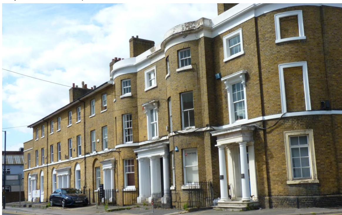
Clarendon Place looking west towards the centre of Maidstone

4.6.3 The existence of early 19 th Century development (and older) on the south side of King Street and also extending further west along it may justify extensions to the Conservation Area, subject to further study work.