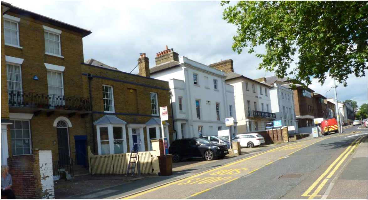
View of Albion Place