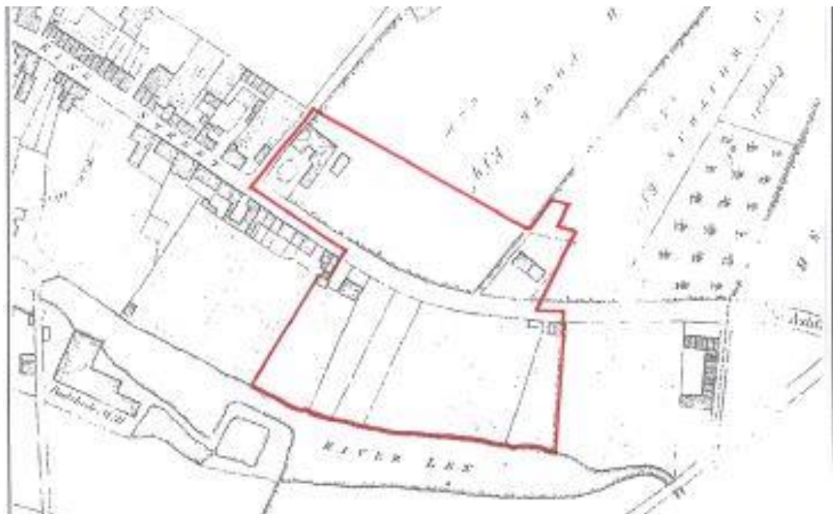
Extract from Brown's Map of 1823 showing current conservation area overlaid

3.2.3 Browns Map of Maidstone (published in 1823 but surveyed in 1821) shows that development at first was slow. Within the Conservation Area the only buildings shown are No. 4 (Lenworth House) and nos. 13/15, the latter on land owned by J Whatman, the paper manufacturer of Turkey Mill. However, by 1839 when J Smith, printer and bookseller of Week Street, published his Topography of Maidstone and Environs the (albeit rather schematic) map included suggests that the road was built up on both sides as far as Square Hill. That this was not entirely the case is shown by the 1 st Edition Ordnance Survey Map of Maidstone published in 1848 where it can be seen that a gap existed on the south side of the road between nos. 6 and 24. However, by 1867, map evidence shows that this gap had been filled and the development of the Conservation Area was complete.