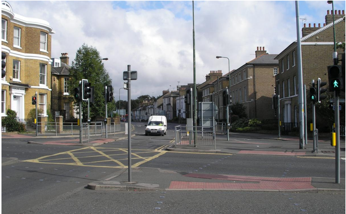
The tangle of barriers, road signs and lights where Watt Tyler Way crosses Ashford Road

4.2.9 As outlined above, the Conservation Area has changed in character from a wholly residential environment of high quality to a largely commercial area. This change took place before the Conservation Area was designated, and in its favour it can be said that it has probably enabled the preservation of the original buildings. On the downside, however, it has resulted in some problems of signage clutter and the giving over of forecourts and rear former gardens to car parking.