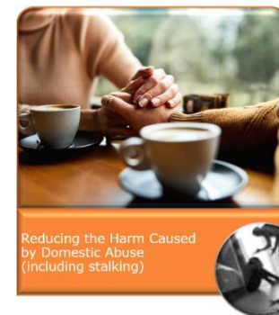
Reducing the Harm Caused by Domestic Abuse (including stalking)